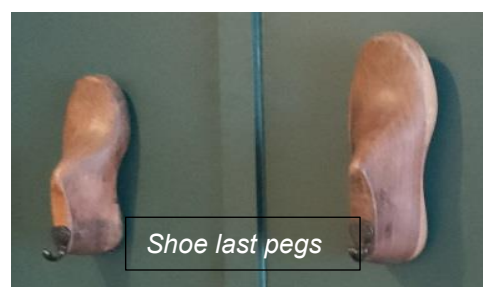
Shoe last pegs