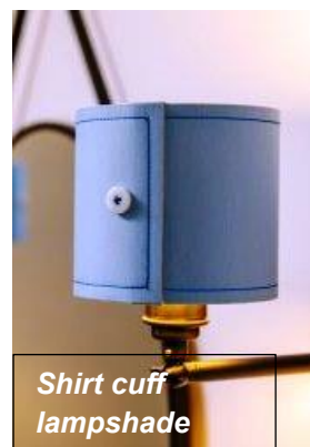
Shirt cuff lampshade

wooden shoe lasts and, in the restaurant, brogue-patterned wooden panels, wire sculptures of Oxford clothing and even a chandelier made from shoe horns. Yet, all these features manage to avoid quaintness and instead are subtle, witty, elegant and somehow classic.